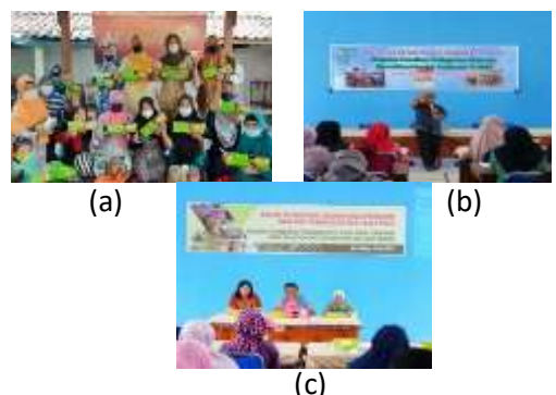
(c) Figure a). Fish Processing Groups with Extension Services, b). Fish Diversification Training and c). Market Expansion Training.

consume fish products affects the development of the fish processing industry. So, the extension services have been provide some training related to market expansion and diversification. Furthermore, Searles et al. (2018) stated that fish processing is one way to increase the value of fish products. Extension services continue to assist fish processing groups so that they can continue to run well. Based on FAO (2017), the online market is currently very open for anyone who wants to do marketing. Widhiastika et al. (2021) stated that selling products through online is one of the best solutions due to pandemic because of changing marketing patterns and consumer needs, so the fishery products could be sold optimally. The training of market expansion, diversification and fisheries processing group is shown by image below.