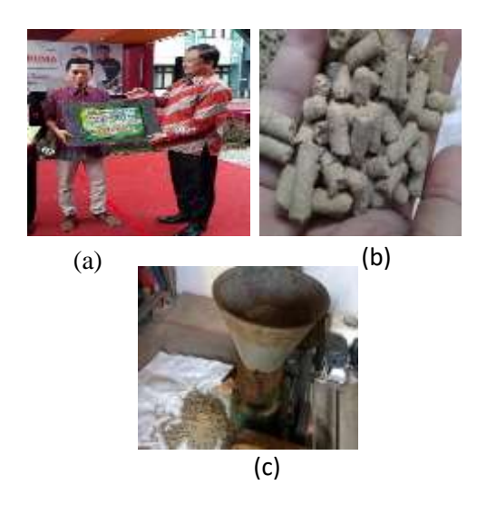
Figure a). Simple Pellet Machine, b). Result of Pellet Machine and c). Sangkuriang Catfish Broodstock Assistance to Farmers.

Pamungkas et al. (2018), fish feed production is formulated appropriately according to the needs of the fish. Moreover, Okolie et al. (2019), stated that the manufacture of feed is very dependent on the design and type of machine used.