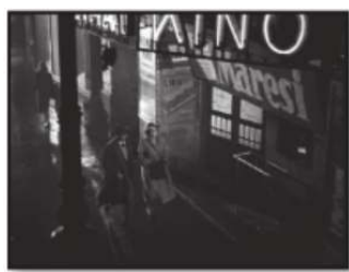
2.2.1.5 Long Shot