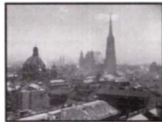
2.2.1.6 Extreme-Long Shot