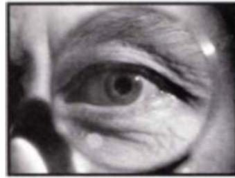
2.2.1.2 Extreme Close-Up Shot