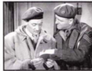
2.2.1.4 Medium-Long Shot