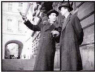
2.2.1.3 Medium Shot