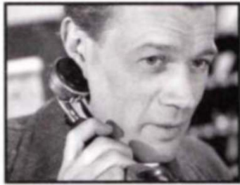
2.2.1.1 Close-Up Shot

The following are examples of the type of camera distance described by the camera distance technique mentioned above, without any subjectivity or additions from the writer.