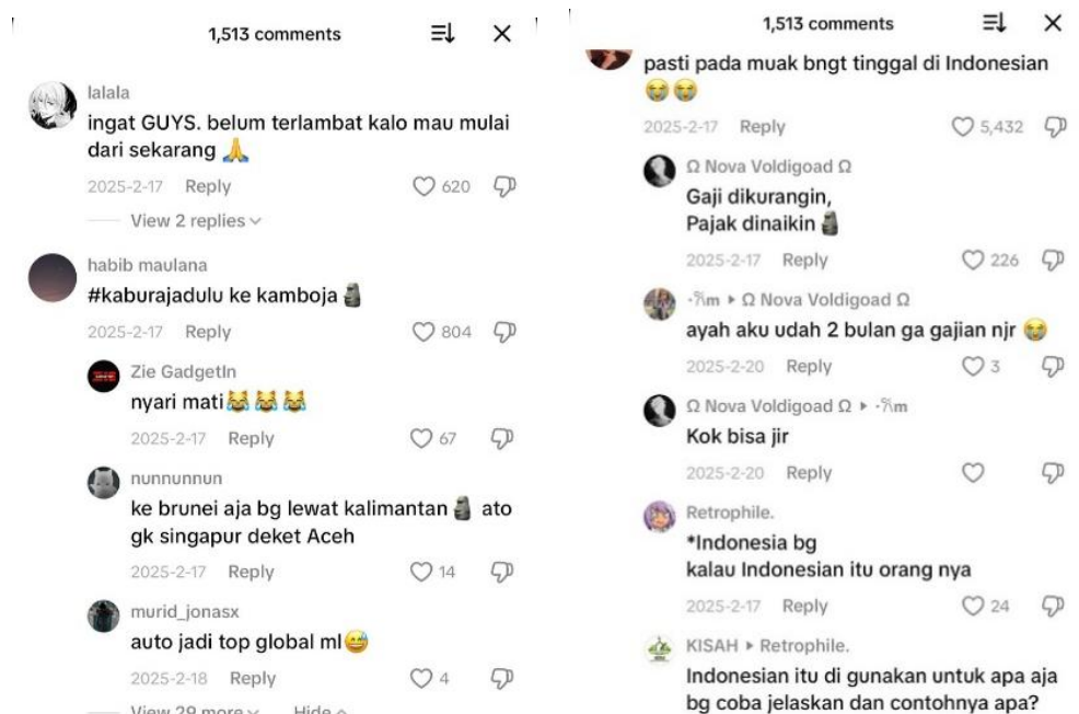
Figure 2. 2 Screenshot of audience comments and discussion threads on the selected #kaburajadulu TikTok video

As shown in the selected TikTok video, users actively participate by reacting to the video's message and to other users' comments. This interaction creates visible discussion threads, where discussions are held, which includes debates and opinions. Through this process, TikTok becomes both a social media platform where it allows content distribution and collective conversation both at the same time.