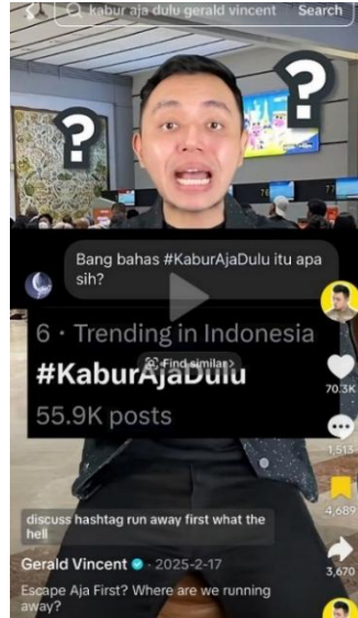
Figure 2. 1 Screenshot of the selected TikTok video using the #kaburajadulu hashtag, displaying the account name, caption, and audience engagement indicators.

As shown in the selected TikTok video, users actively participate by reacting to the video's message and to other users' comments. This interaction creates visible discussion threads, where discussions are held, which includes debates and opinions. Through this process, TikTok becomes both a social media platform where it allows content distribution and collective conversation both at the same time.