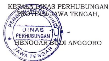
Figure 2. 3 List of Positions and Positions in the PPID Team of the Central Java Provincial Transportation Service