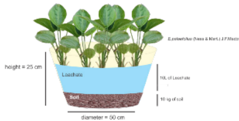
Figure 1. Constructed Wetlands design