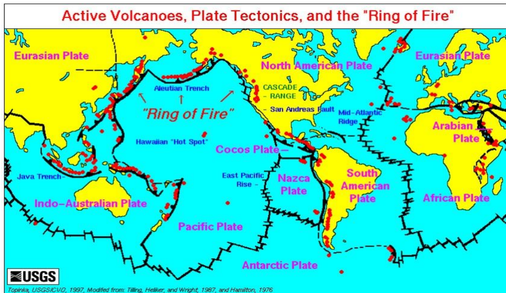
Figure 1. Pacific Ring of Fire area (Map source: United States Geological Survey (USGS) 1997).

This condition, if it occurs continuously, can undoubtedly put significant pressure on government expenditure / APBN (Indonesia Ministry of Finance 2018a). Therefore, given the large number of losses that must be borne by the government, a system that can cope with the risk of disasters should be formed, to reduce the burden on the government. One way that can be done is by risk transfer to the private sector through a natural disaster insurance scheme (Prihanadi 2017).