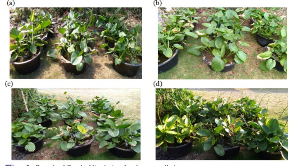
Figure 2 . Growth of E. palaefolius during the phytoremediation 0 DAP (a), 7 DAP (b), 14 DAP (c), 21 DAP (d)

It can be seen in Figure 3 that there is an increase in the rate of absorption of E. palaefolius in accumulating Fe metal from leachate water in 21 DAP on various roots, stems and leaves. The highest increase in absorption rate occurred at 7 DAP and 14 DAP. It is known that the rate of absorption in the roots reaches 1.56 mg/kg/day at 7 DAP, in the stem reaches 63.71 mg/kg/day, and in the leaves reaches 104 mg/kg/day. However, it