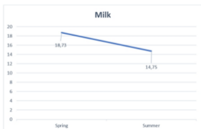
2 Fig. 2. Relationship between milk content levels and seasonal differences.