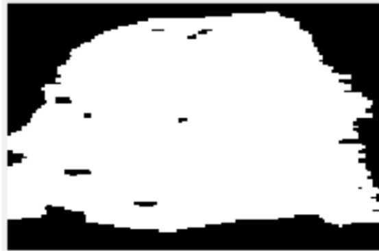
Figure 2. Image result of thresholding segmentation

In the test process segmentation stage is performed on the image of the tumor with thresholding operation that produces binary image, with the object represented by pixel which is worth 1 (white), while the background is represented by 0 pixels (black). An example of the result of the thresholding segmentation stage in the test image is shown in Figure 2.