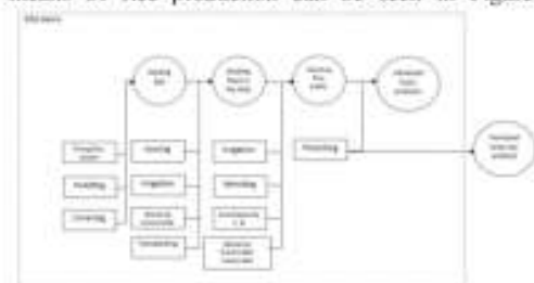
Fig. 1. DEA items for your DMU unit on each rice field [10].

The DEA framework involving the retrieval of input and output data in the LCA involving the agricultural means of rice production can be seen in Figure 1.