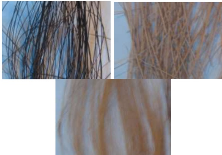
Figure 1. Variation of bundle fiber surface appearance

Density of bundle fiber shows a increase on treated Aren frond fibers. The density of the alkali treated fibers can reach at the highest at 0,54 \text{ gram/cm}^3 which it is higher than 0,34 \text{ gram/cm}^3 for untreated fibers. This may correspond with reduction impurities such as hemicellulose, lignin, pectin, and waxes. Alkali treatment of Snake Fruit frond fiber reduced hemicellulose percentage [1] [2]. Density of fan palm fibers has a trend to increase after treatments the alkali treated [3]. The decrease of hemicellulose (the increase in cellulose content) after treatment was also believed to be responsible for the increased density [4]. The density of hemp fibers increased after several chemical treatments including alkaline, acetic anhydride, maleic anhydride and silane [5].