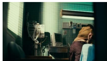
Picture 2 (01:21:34) [Arthur kills his mom]

After sensing the bitter truth about himself and knowing that his mom was a bad and guilty mom, Arthur is coming back to the hospital to meet his mother. Arthur has short conversation with his mother. After pouring everything into the