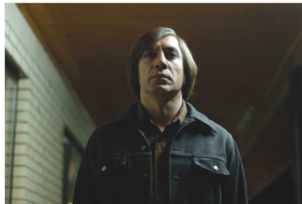
Shoulder Level Shot Example in No Country For Old Men (00:32:28)

Here are some examples of shots and camera angles :