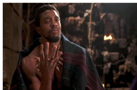
Shoulder Level Shot in Black Panther (00:32:20)