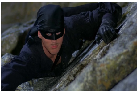
High Angle Shot in The Princess Bride (00:18:20)