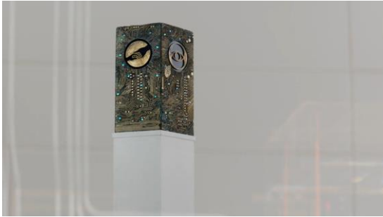
Picture 3.2 (01:14:00 – Medium Shot) [Scene: The Box for simulation]