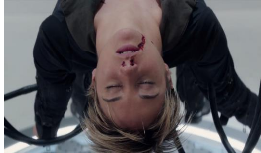
Picture 3.3 (1:30:27 – Close-Up Shot) [Scene: Tris fainted while doing the last simulation]

This place is a witness to Tris Prior's torture as she is forced to do simulations against her fears and solve problems according to the faction. In this place, Tris Prior is also critical and even died because her body could no longer accommodate the pain from the high dose of paralysis medicine.