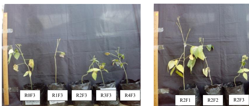
Figure 1. Green bean in interaction treatment

Table 1. and Figure 1. showed that the tallest of the height plant is F1 treatment (48.80 cm), and F3 (31.53 cm) is the shortest. Perlakuan F1 berbeda nyata dengan perlakuan F2 dan F3. The height of green beans planted every day is higher than that of plants that are watered every other day and every three days. Daily watering treatment makes the plant height higher by 12.4% and 31% in F2 and F3, respectively. Green bean plants that are watered once a day have the highest value. Research by Daba and Tadese (2018) [2] concluded that Moringa olifera plants that are watered with sufficient water capacity consistently every day have optimum growth compared to those that are not.