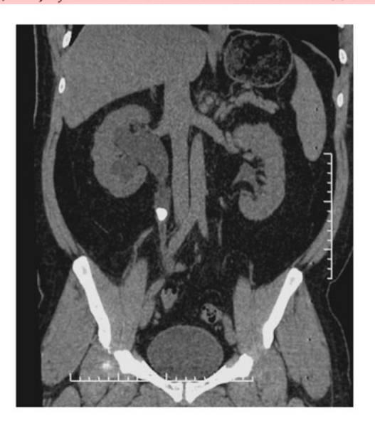
Figure 1. Image of CT Scan Stonography combination of ASIR 40% with WW350, WL64 that produced the mostoptimal image anatomical quality