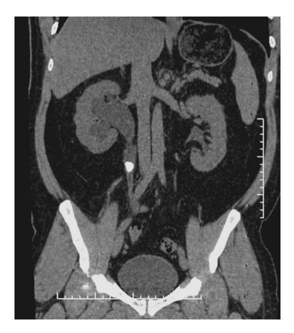
Figure 1. Image of CT Scan Stonography combination of ASIR 40% with WW350, WL64 that produced the mostoptimal image anatomical quality