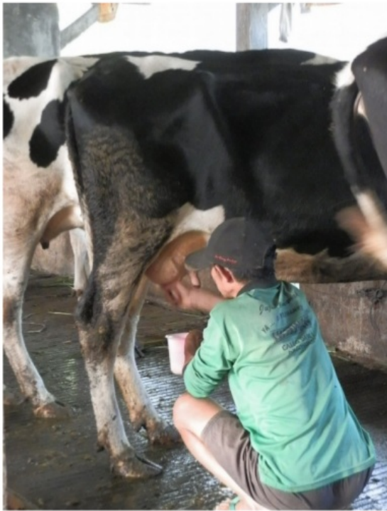
Illustration 1. A milking practise by a farmer did not consider the sanitary principal