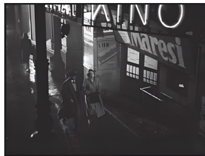
Picture 2.2 Long Shot