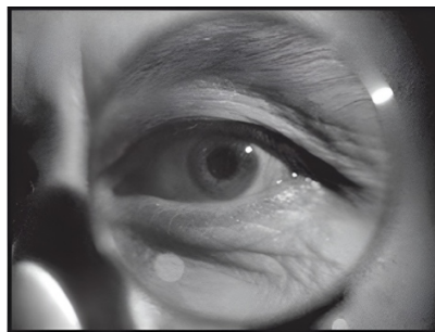
Picture 2.7 Extreme Close-up Shot