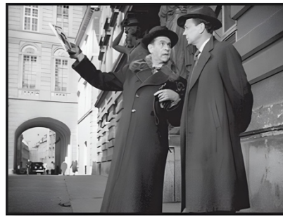
Picture 2.4 Medium Shot