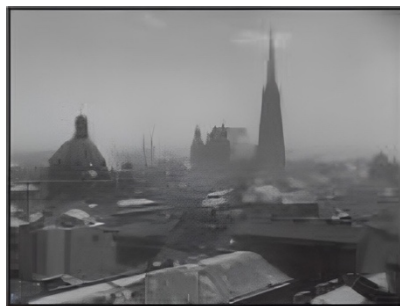
Picture 2.1 Extreme Long Shot