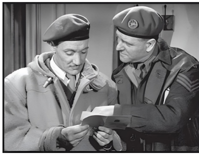
Picture 2.3 Medium Long Shot

a close-up and a lingering shot. This shot is often considered more neutral because it is neither too close nor too far away. Although the character is present, the viewer remains close to the scene. On the other hand, a medium shot shows the individual from the waist up. This framing technique animates the viewer's perception of the character. It mimics the level of closeness people typically maintain during face-to-face conversations, making it appear more authentic.