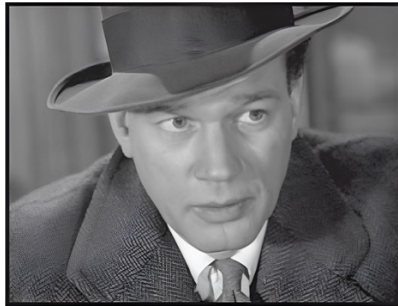
Picture 2.5 Medium Close-up Shot