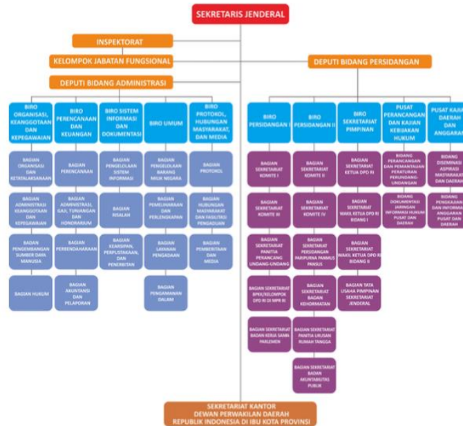
Figure 2. 1 Organizational Structure of the Secretariat General of the Regional Representative Council