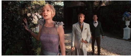
Figure 3. Daisy much years later finally meet Gatsby again

marry a girl just because she's pretty, but my goodness doesn't it help?" ((Hawks, 1953)). While at the same time, the ecological revolution in this partake of scene shows Daisy and her willingness to choose something over greater beyond, showing that she is capable to choose rather than to just dwell in something uncertain for her.