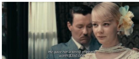
Figure 2. Daisy Buchanan receives proposal marriage from Tom Buchanan

In this scene, Daisy was firstly introduced, explained by Nicky how her appearance and personality could be, thus also mentioned her appearance, golden girl which not only express how she is a golden to his heart, but also dedicated to her hair. As her appearance, with the expression that she shows, it is somewhat related to how the stereotype goes exactly how blonde woman often expressed, even in this film which exist in 1920s, as mentioned by Imperial (2022), according to the historical accuracy, the roaring of 20s era has redefined American society through progressivism and set of modernization. Which this is also implicate how her personality as though mentioned by Nicky indicate that Daisy is one of the modern woman in the film. While the stereotype occurs as how people sees Daisy and her persona, it is not far indeed from how the subjectivity that exist in Daisy therefore lead to the explanation as mentioned by the character, characterized Daisy and her hollow traits, which refer to the subjectivity that exist.