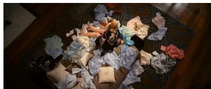
Figure 4. Piled of clothes merged Daisy

This particular scene overlook how the stereotype which leans on the choice of path that Daisy had done and how she may slightly undertook her feeling of lost after meeting Gatsby few times indicate the implicate of non-emotion that perhaps exist in blonde woman. "Too much" expresses a notion of weight, implying that Gatsby's dedication and need for an unambiguous past transcend Daisy's ability for true Emotional reciprocity, thus this reveals her great inability for persistent, demanding feeling and cements her image as emotionally shallow and self-centred (Ma, 2025).