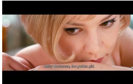
Figure 1. Daisy Buchanan first introduced

The result followed by the discussion that indicate from this film solely express how blonde women are mostly stereotyped are explained below