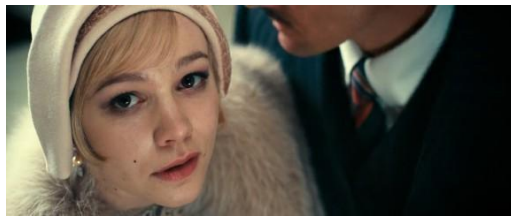
Figure 5. Daisy who heard the news regarding Gatsby