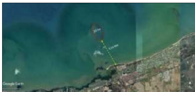
Fig 1: Location of research study

The primary data for this study consisted of water depth data and bottom substrate. Water depth data collection was carried out using hydrographic survey standards (SNI Hydrographic 7646 of 2010). The survey area is 6.21 km 2 (2.7 x 2.3 km) (Fig. 2). Bathymetric Survey was carried out using a GPS Map 585 type single beam echosounder using a frequency of 50 Hz, the horizontal position accuracy is ±2-5 m (DGPS-WAAS Enable), and the vertical position accuracy is ±0.2 m. The survey was carried out with fishing boats for 3 (three) days with a maximum speed of the vessels during the survey is 7 (seven) knots. A bathymetric line on the survey consists of 55 line perpendicular to the coastline with a spacing of 50 m and 7 (seven) line parallel to the coastline with a spacing of 400 m.