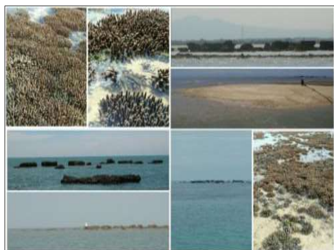
Fig 3: The condition of Pulo Suwalan at low tide

available. Data and information on the field area are also still limited. Its critical condition, coupled with pressure from the surrounding environment, requires a planned and sustainable treatment. The protection and preservation of coral reef ecosystems have the potential to support the welfare of the surrounding community through appropriate management efforts [32-34]. Coral reefs that are properly managed can generate economic value [35]. Some of the economic values of coral reefs include wave barriers, fish growth areas, capture fisheries activities, and seaweed cultivation [36]. Another economic value of the existence of coral reefs is as a marine tourism area [37-39].