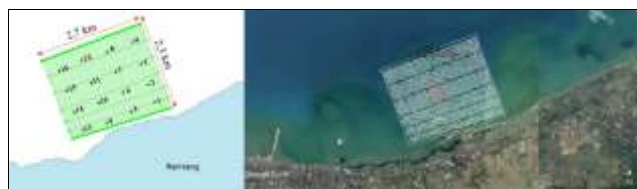
Fig 2: Bathymetric line survey and station of substrate sampling

Bottom substrate data was collected using a grab sampler. Sampling of substrate was carried out at 16 (sixteen) stations with the number of sample per station being 1000 g/station. Furthermore, the substrate samples were analyzed for grain size in the laboratory. Samples of the seabed substrate can be taken using a grab sampler and can represent the character of the sediment which is located in the top layer of a bottom waterbed [9]. The water bottom substrate sampling station points can be seen in Figure 2. Bathymetry analysis is done by calculating the actual water depth. Water depth is actually obtained by making depth corrections based on tidal elevation, transducer draft, and also tides (Z 0 ). To calculate the depth reduction value, an equation is follow [10]: