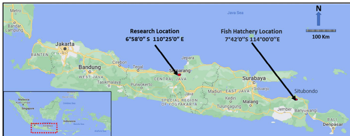
Figure 1. Research location.

Research setting. This research was conducted for 40 days from October to November 2022 at the Laboratory of the Faculty of Fisheries and Marine Sciences, Universitas Diponegoro, Semarang City (Indonesia). TGGG hybrid grouper fingerlings were obtained from a marine fish hatchery in Situbondo (Figure 1) which have been adapted to rearing media with low-salinity water.