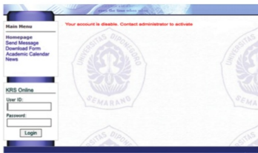
Fig. 4. View page of temporary block account.

Challenge is not necessary for next login. But if the ATT Challenge fails, the user account will be disabled.