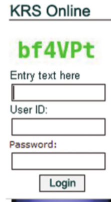
Fig. 2. CAPTCHA form will appear when ip address not in whitelist.

If IP address is not listed on white list, then user will be given an ATT challenge. If ATT challenge is unsuccessful by user, then user will be disabled and should contact the administrator for access again.